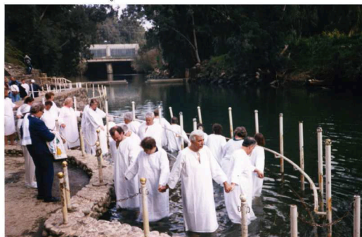
Baptism in the River Jordan