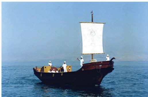
Sail across the Sea of Galilee