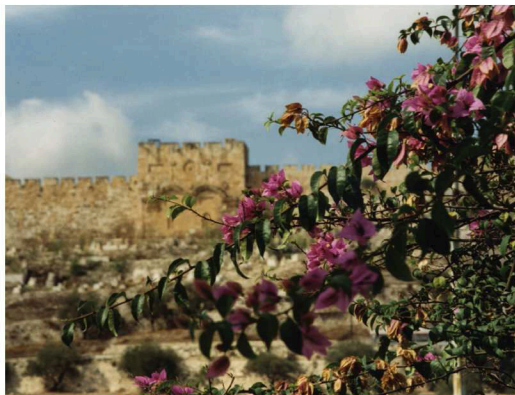
Eastern (Golden) Gate