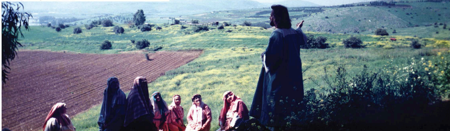
Sermon on the Mount